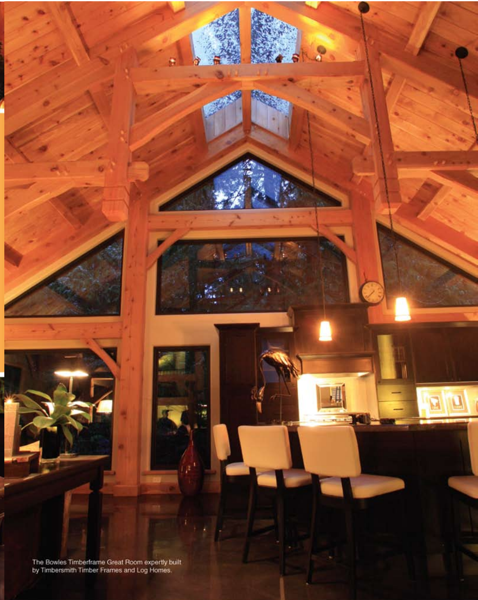
The Bowles Timberframe Great Room expertly built by Timbersmith Timber Frames and Log Homes.