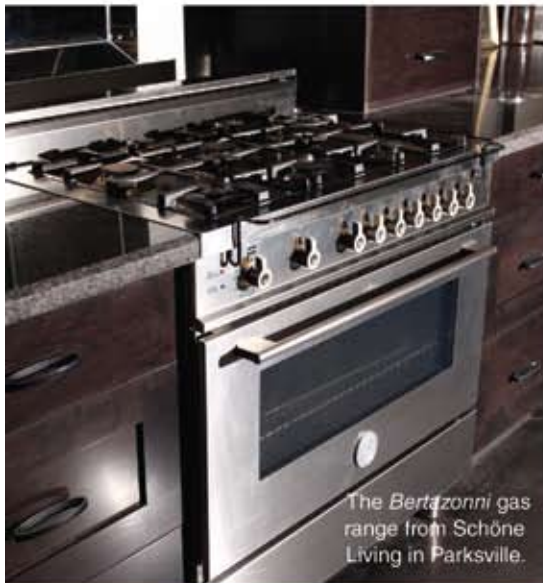
The Bertazonni gas range from Schöne Living in Parksville.

Espresso Cabinetry house the stainless steel appliances from Schöne Living of Parksville. The dishwasher, of course, is a Miele renowned for their super quiet yet flawless cleaning ability. Now, the gas range... you have to check out the gas range. It's a Bertazonni. It's from Italy. It's sold exclusively at Schöne Living. The Bertazonni gas range is simply incredible and it's so well priced you will be pleasantly surprised.