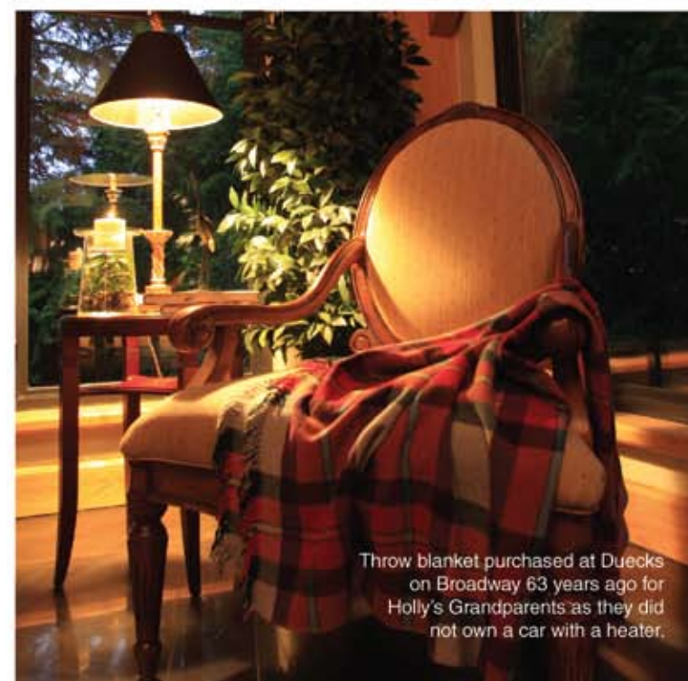
Throw blanket purchased at Duecks on Broadway 63 years ago for Holly's Grandparents as they did not own a car with a heater.