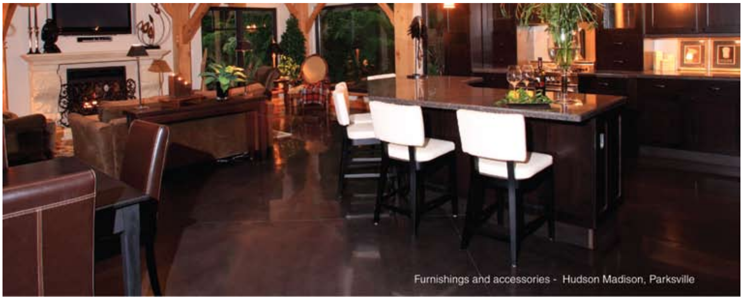
Furnishings and accessories - Hudson Madison, Parksville